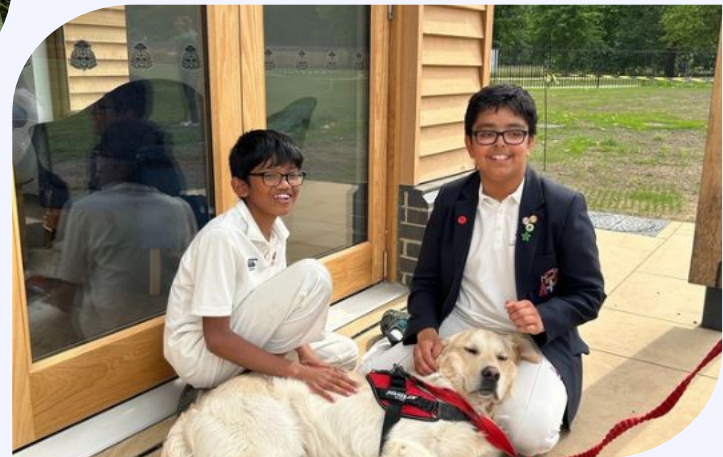
Our boys made friends with these beautiful dogs who belong to a lovely parent from Cokethorpe School who joined us for this week's cricket match.