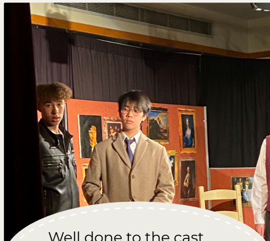
Well done to the cast and crew on a great performance!