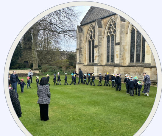
Easter Bonnet Parade