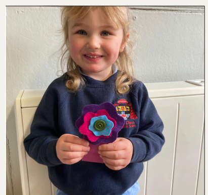
More arts and crafts from Nursery for Mothering Sunday!