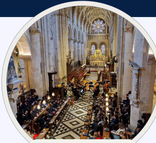
Winchester String Concert