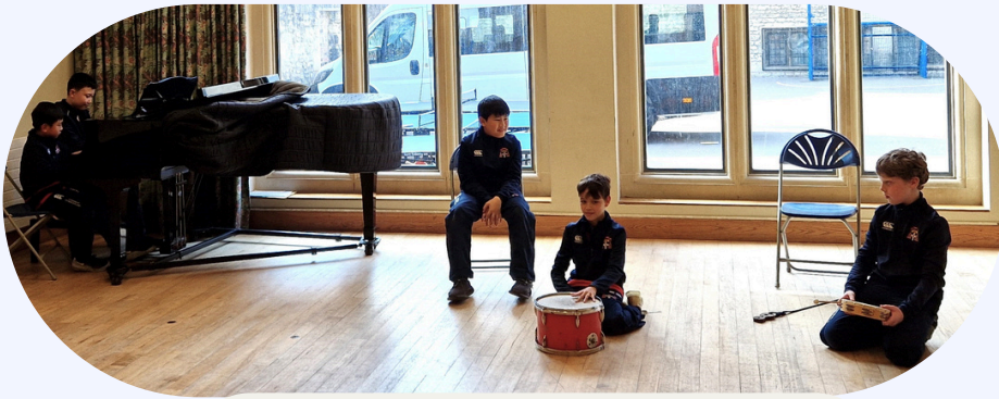
More wonderful compositions from Form 5