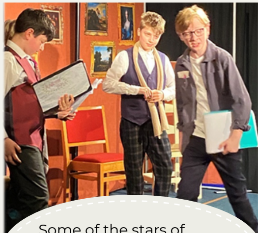
Some of the stars of 'William Wilton'