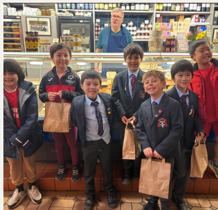
Merci Beaucoup Monsieur!