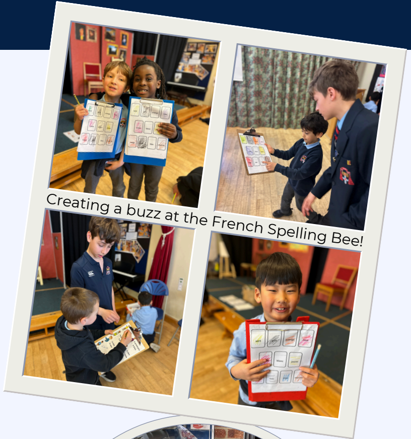
Creating a buzz at the French Spelling Bee!