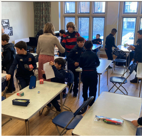
Prep Spelling Bee fun