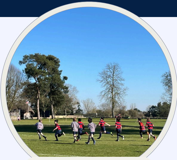
CCCS on Merton Field