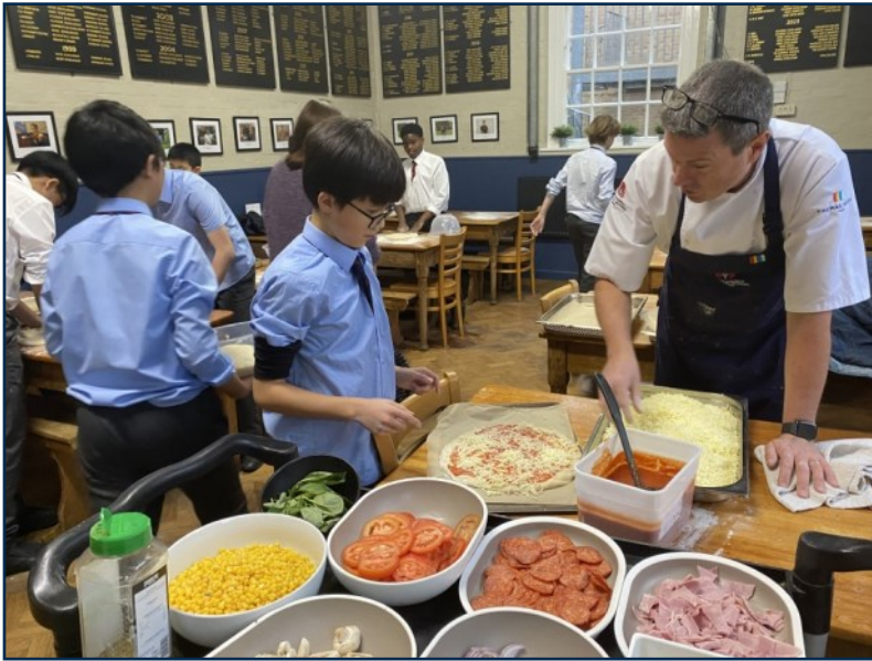
Cookery Club in action