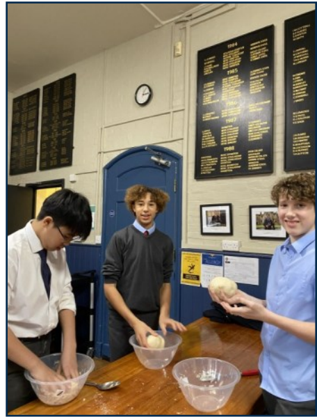
Peaceful form time in Forms 3 and 4