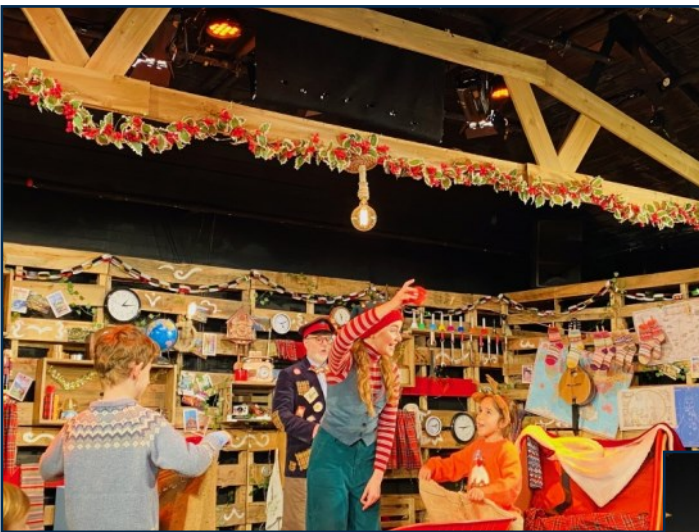
And here are Pre-Prep in their own performance of the Nativity