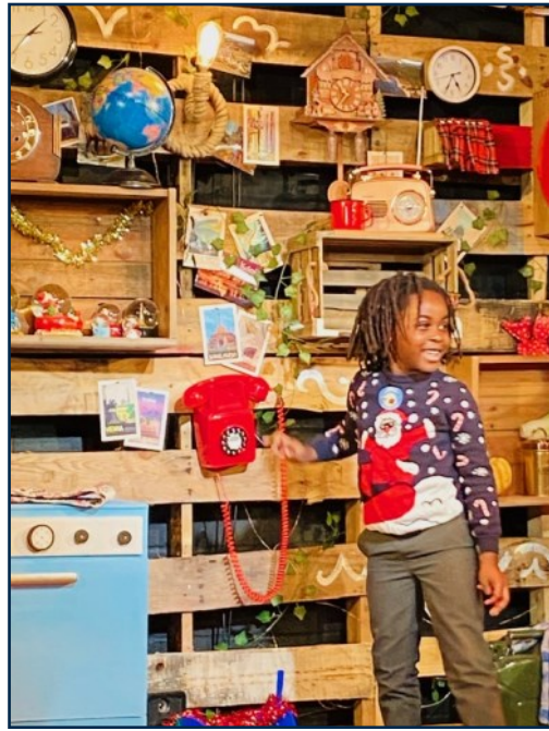
Pre-Prep and Nursery had a great trip to see Hurry Up Father Christmas at the Burton Taylor Studio