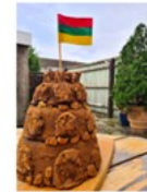
The Gediminas Tower, Lithuania