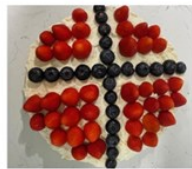
Flags – Lebanon (Alex F5) and Norway (Armaan F5)