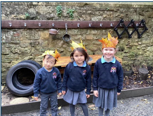
Nursery have sewn leaves together to make beautiful autumn crowns. HB