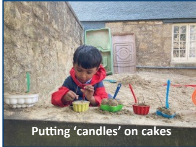
Putting 'candles' on cakes

The children are working with great imagination in the block play area, our new intentionally prepared part of our Nursery Classroom. Having materials accessible and available all of the time makes such a difference as children include brick play in their days. The children are beginning to own the area, learning how to care and construct independently, and collaboratively. HB