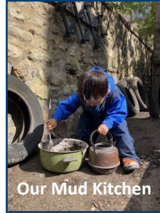
Our Mud Kitchen