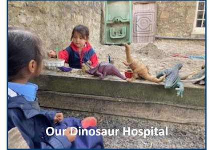
Our Dinosaur Hospital