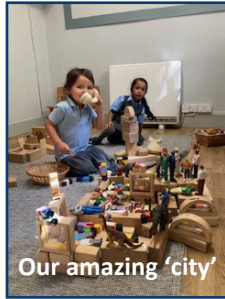
Our amazing 'city'