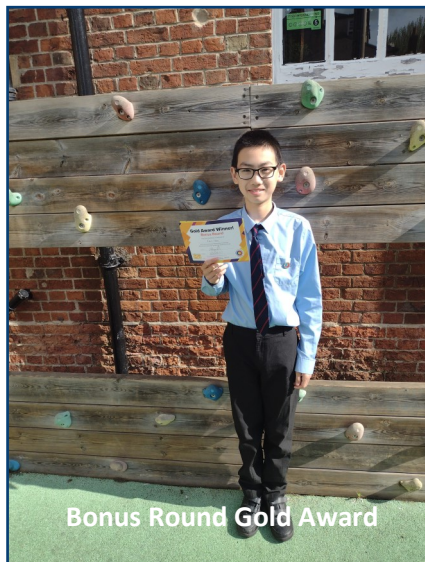
Bonus Round Gold Award