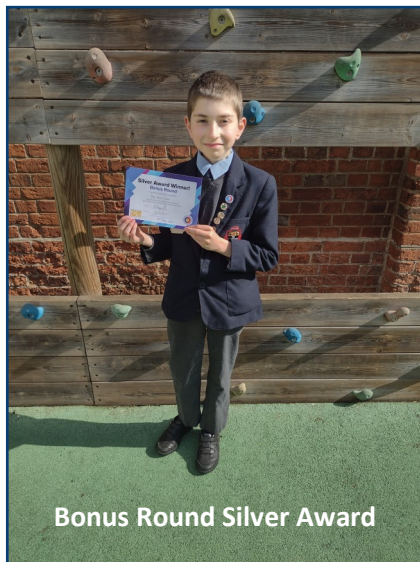
Bonus Round Silver Award