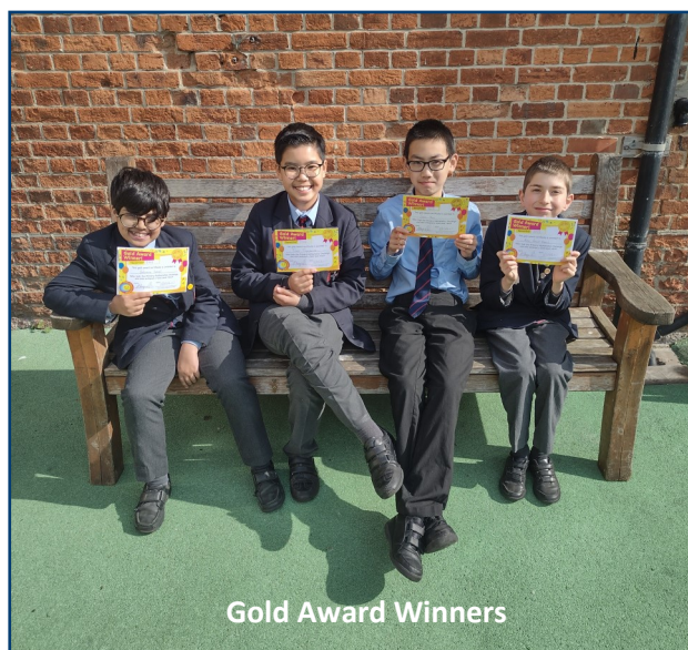
Gold Award Winners

Well done to all boys who took part and especially those who received awards - an excellent achievement.