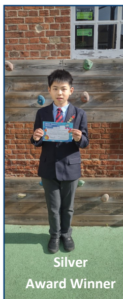
Silver Award Winner