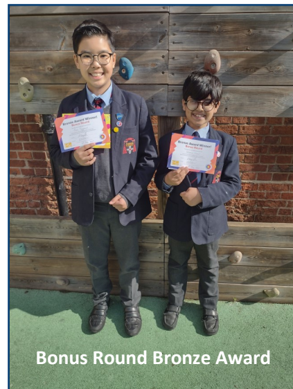
Bonus Round Bronze Award