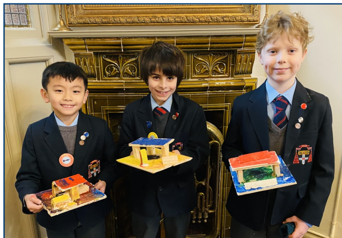
Form 3s Vulcanal Shrines