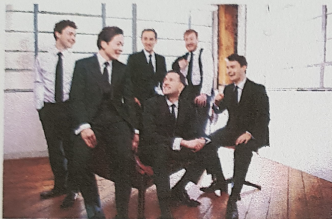
The King's Singers Saturday 8th May 7.30pm