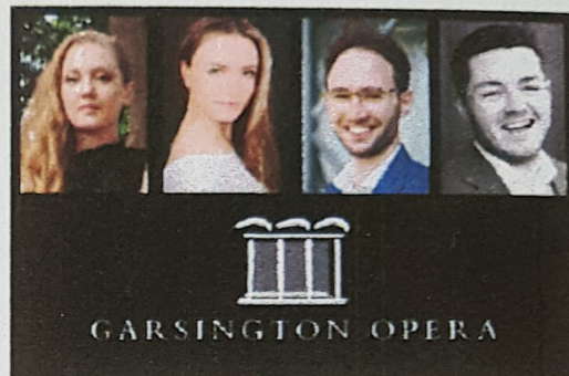
Garsington Opera Garden Concert Saturday 30th April 4pm