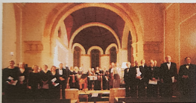
Monteverdi Vespers Thames Consort Saturday 7th May 7.30pm