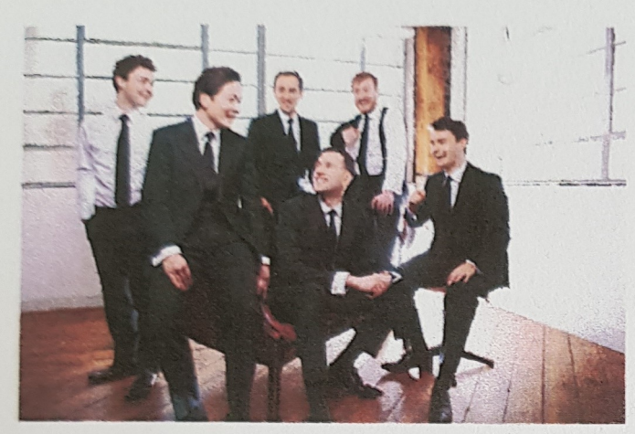
The King's Singers Saturday 8th May 7.30pm