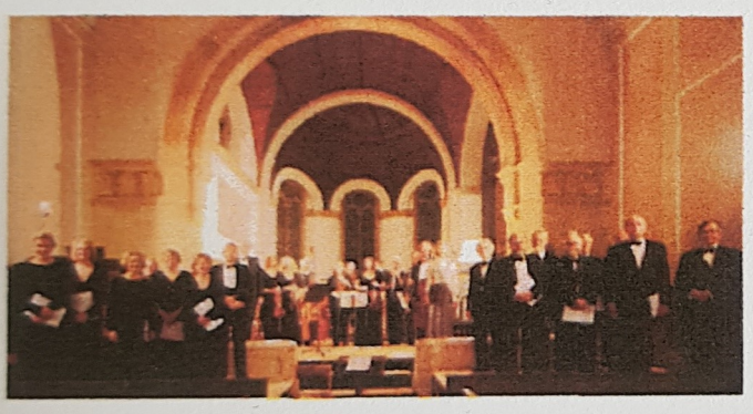
Monteverdi Vespers Thames Consort Saturday 7th May 7.30pm