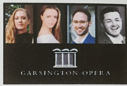
Garsington Opera Garden Concert Saturday 30th April 4pm